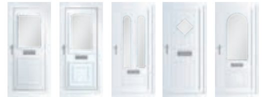
Back Door Bordeaux Cambridge Cornwall Devon

From traditional to contemporary, we've the perfect design for your home – which you can customise with your choice of colour and door furniture.