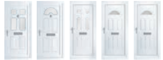
Edwardian Georgian Palermo Toulouse Verona