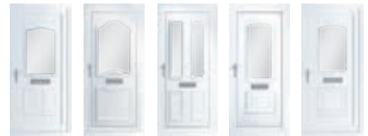
Jacobean Lisbon Monaco Quebec Victorian