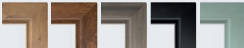
Irish Oak Golden Oak AnTeak* Black Woodgrain Chartwell Green