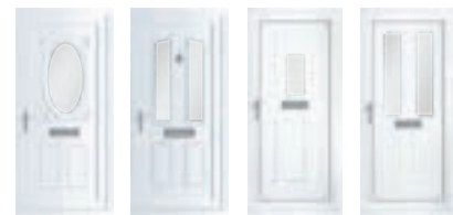
Warwick Windsor Xanthi York