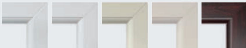
Smooth White White Woodgrain Smooth Ivory Cream Woodgrain Rosewood